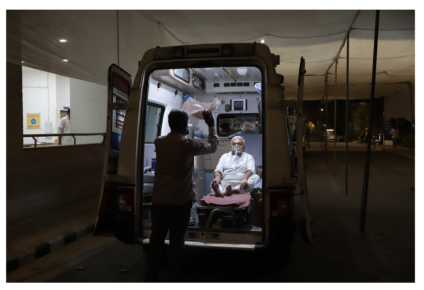
A COVID-19 patient who was refused admission at the Sardar Vallabhbhai Patel Hospital in Ahmedabad on 17 April, sits in an ambulance outside the hospital.