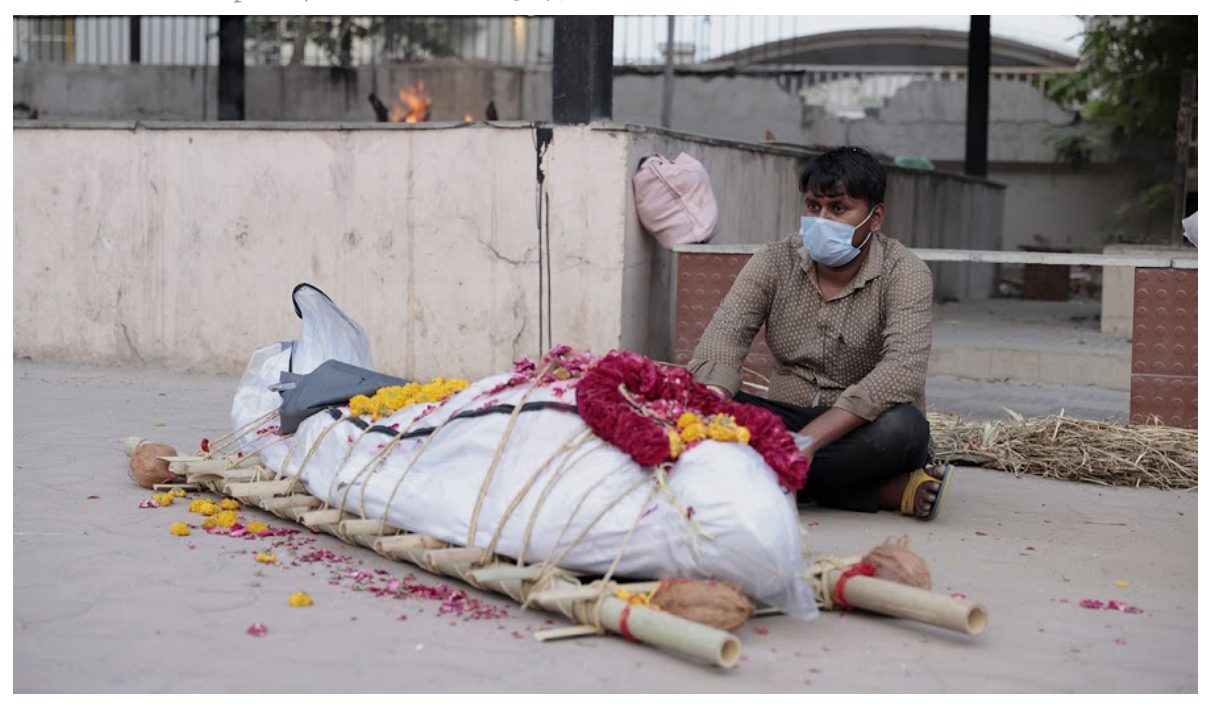
A relative sitting beside the body of a deceased COVID-19 patient at the Ahmedabad Crematorium. SHAHID TANTRAY FOR THE CARAVAN

(https://caravanmagazine.in/health/covid19-patients-struggle-to-get-into-ahmedabad-hospitals/attachment-16987)