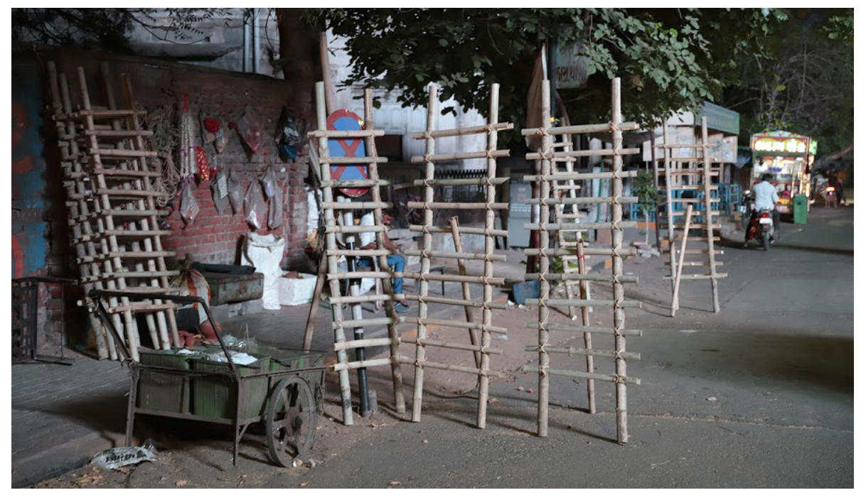
People selling nanamis—stretchers to carry the dead—on the roadside in Ahmedabad.

(https://caravanmagazine.in/health/covid19-patients-struggle-to-get-into-ahmedabad-hospitals/attachment-16986)