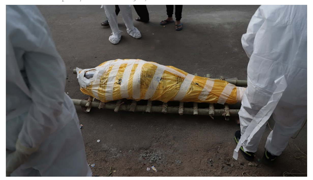
The body of a COVID-19 casualty at the Ahmedabad Crematorium.

(https://caravanmagazine.in/health/covid19-patients-struggle-to-get-into-ahmedabad-hospitals/attachment-16988)